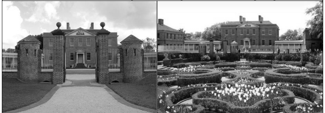
Historic Tryon Palace and beautiful gardens was North Carolina's first capital