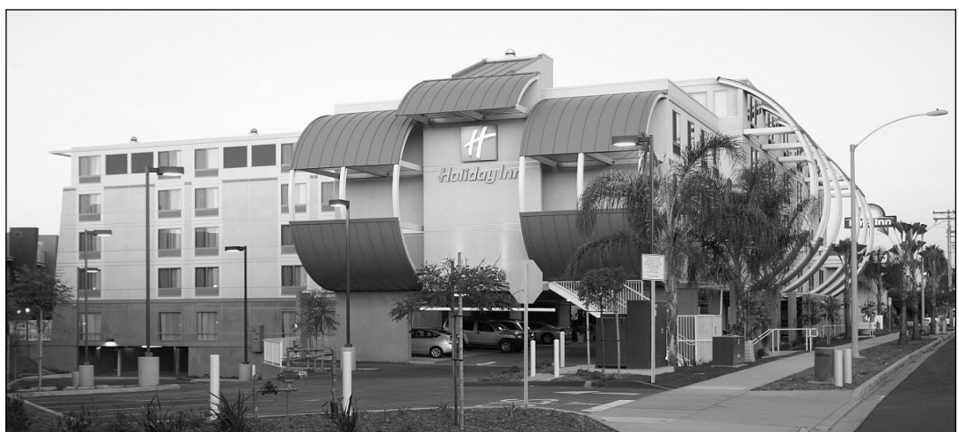
The Holiday Inn Marina, Oceanside Will Host 2014 USMCCCA Conference

The issue was further complicated by the